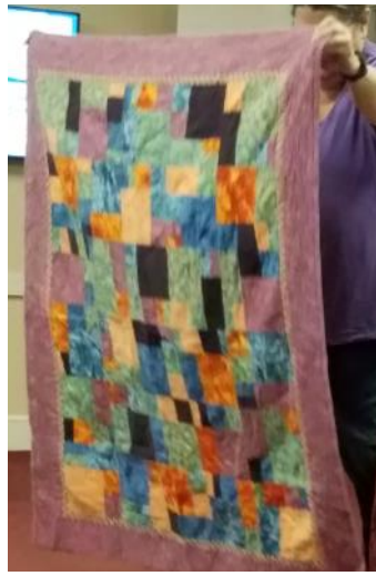
Pamela Avara: Crazy