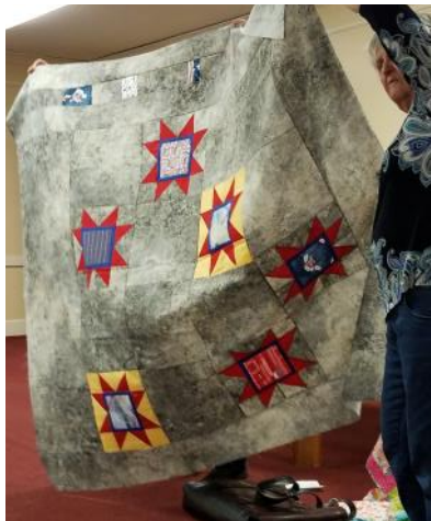
Quilt of Valor